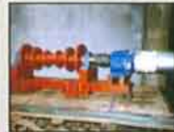
DIABOLIC ROLL CONVEYOR