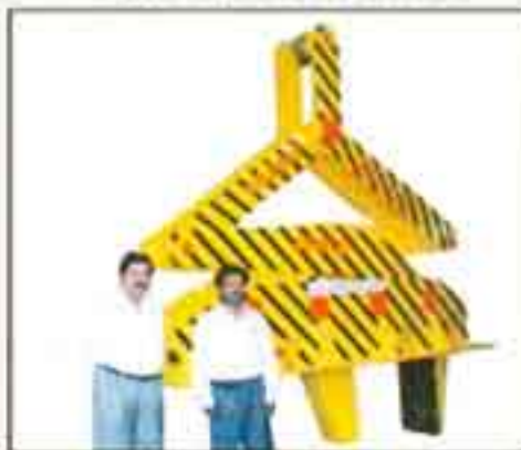
Coil Tong/grap up to 35 tons