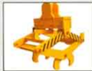
COIL GRAB FOR SOLID DRUM