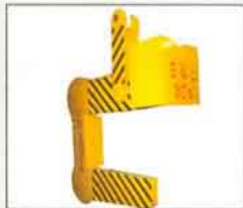
'C' Hooks up to 35 tons