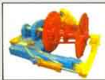
HYDRAULIC SCRAP WINDER