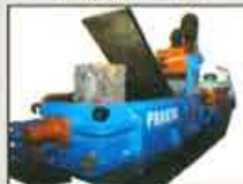
SCRAP BAILING PRESS