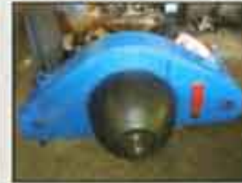
POST-BENDING TOP ROLL FOR SAW PIPE PLANT UP TO 56" DIA