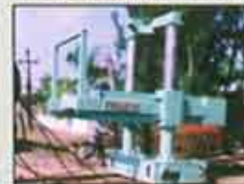
TWIN COLUMN VERTICAL WELDING BOOM