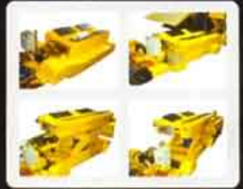
Vertical Pillar Coil Car