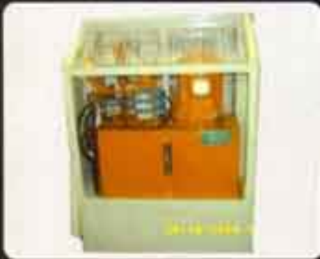
Floor Mounted L Type Coil Car with Hyd. Power Pack