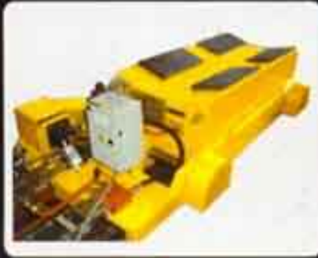
Scissor Type Coil Car