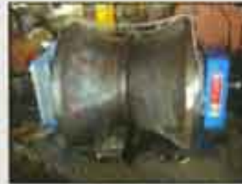
POST-BENDING BOTTOM ROLL FOR SAW PIPE PLANT UP TO 56" DIA