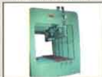
HYDRAULIC PRESS CAPACITY 600T