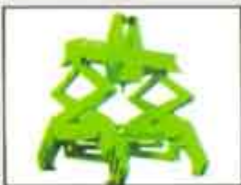
SLAB LIFTING TONG