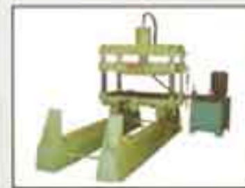
HYDRAULIC CUT OF CARRIAGE FOR CRHR PANELS/SHEETS