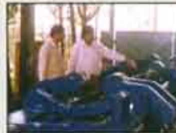
HYDRAULIC PIPE ROTATOR