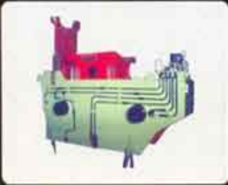
Box type Coil Car