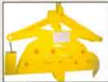
COIL GRAB / COIL TONG