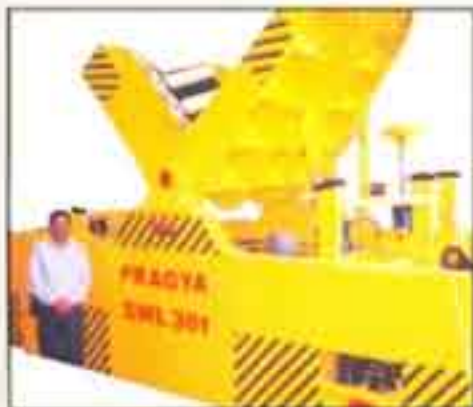
Coil Tilter Cum Trolley up to 70 tons

i.e. 'C' Hooks, coil upender/downender, Coil grabs, coil transfer cars Capacity 5 to 35 tons