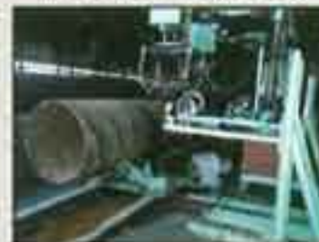
ROLL ADVANCING CONVEYOR FOR U.T.