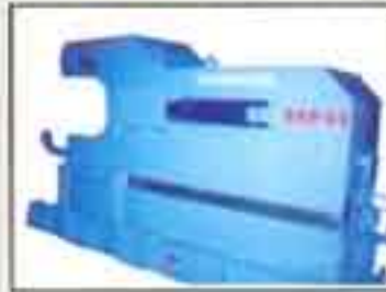
HYDRAULIC BELT WRAPPER